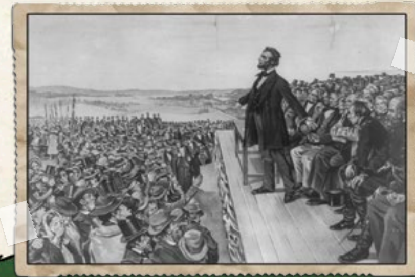
Giving the Gettysburg Address, 1863