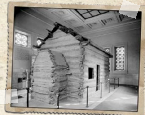
Replica of Abraham's first home, found at the Lincoln Birthplace National Historical Park in Kentucky