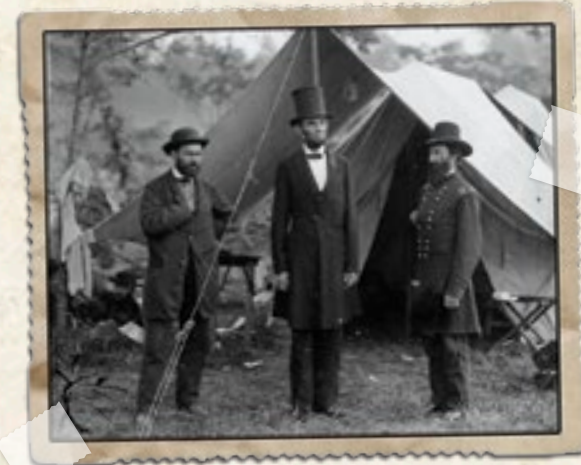
During the Civil War, 1862