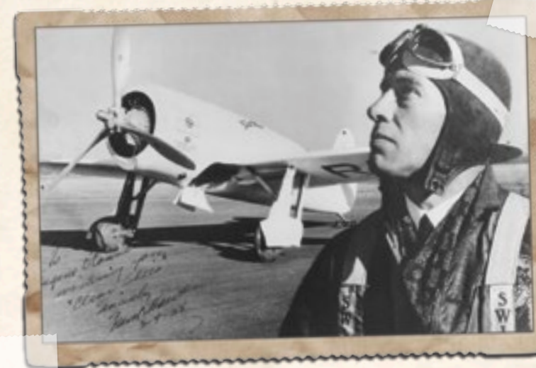
Frank Hawks, pilot who first took Amelia on an airplane ride