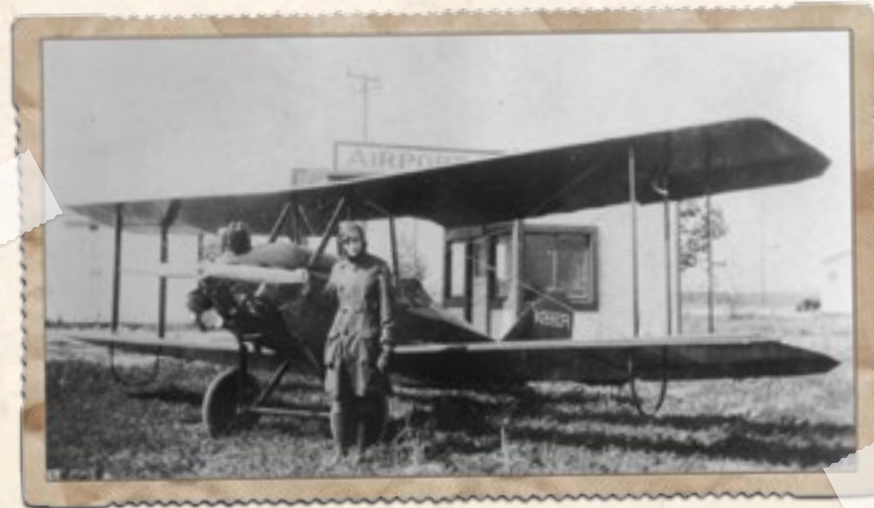
Amelia with her first plane, the Kinner Airster biplane, which she named Canary